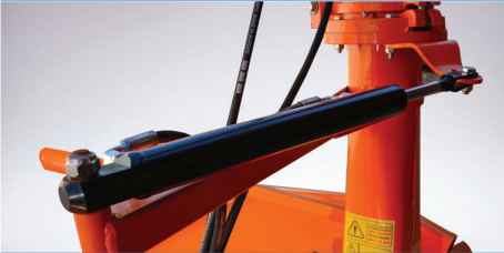
90 degree rotatable chute system with rapid control