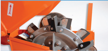
High quality durable blades (12 pcs)