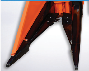
Cutting blades ensures the fast and continuous intake of the harvested crops