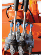
Hydraulic components to ease the usage of chute system