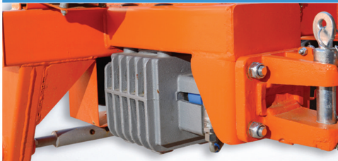
Rapid transmission system with reinforced chassis