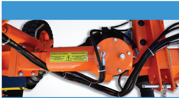
Independent hydraulic system