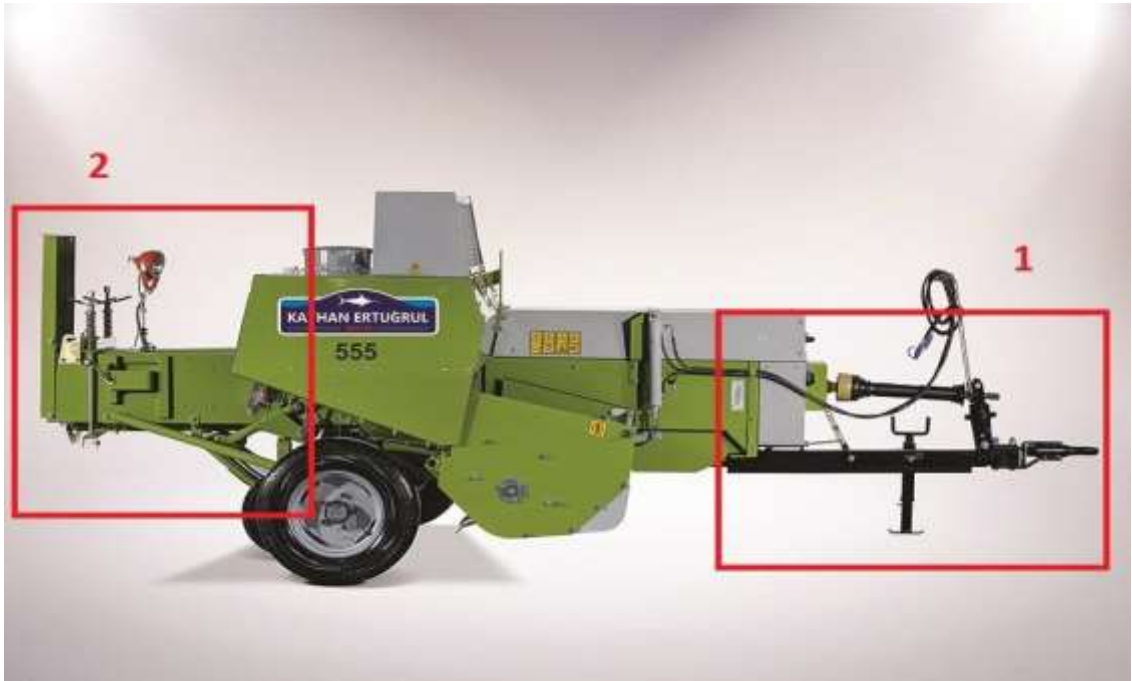
Overview to the machine