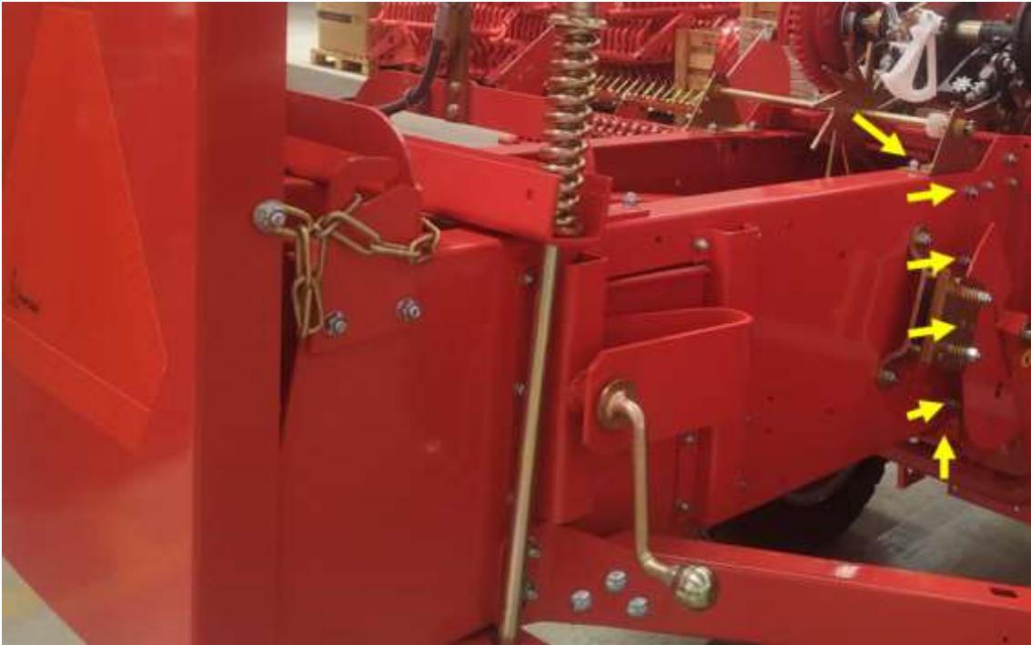
Tighten the bale chamber nuts from each side.