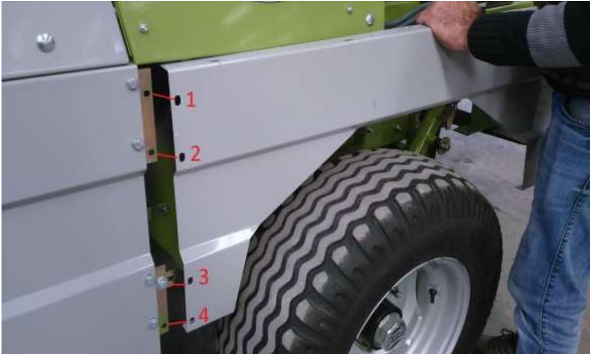
Put the back cover on the machine and connect it with cover nuts from the numbered places on the picture.